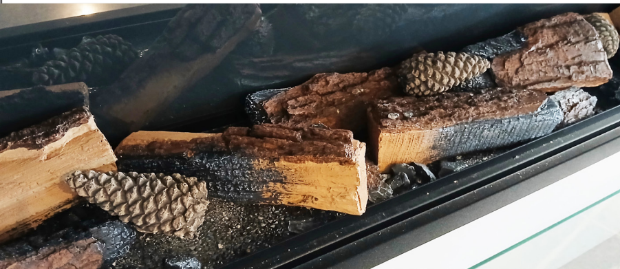
Velare 1500 hybrid electric fire