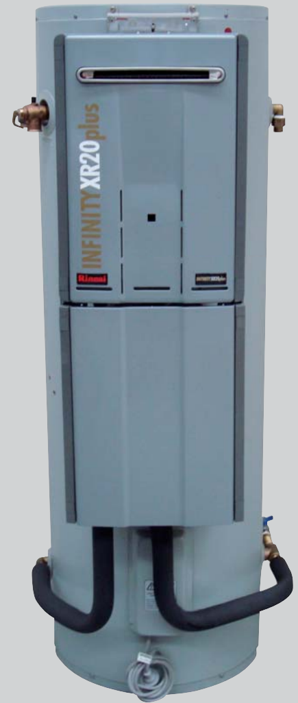
Rinnai Demand Duo System

The thermostat senses the temperature of the water in the tank, and when it drops below the set point, the primary pump is activated. This flow in turn starts the Rinnai continuous flow HD water heater which returns heated water to the tank.