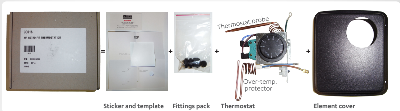
Sticker and template