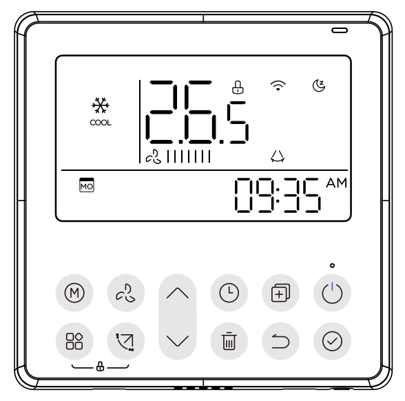
Standard wall controller

For full functionality and operation refer to the separate owner and installer guide provided with the controller.