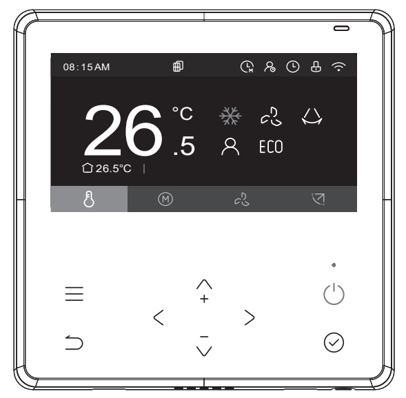
Deluxe wall controllers (available in black or white)