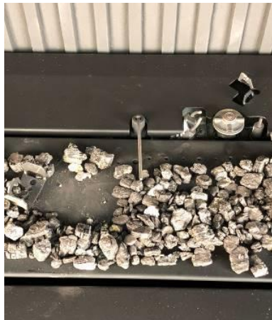
Keep Vermiculite away from directly in front of the Pilot