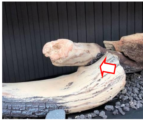
Log locating bump on log