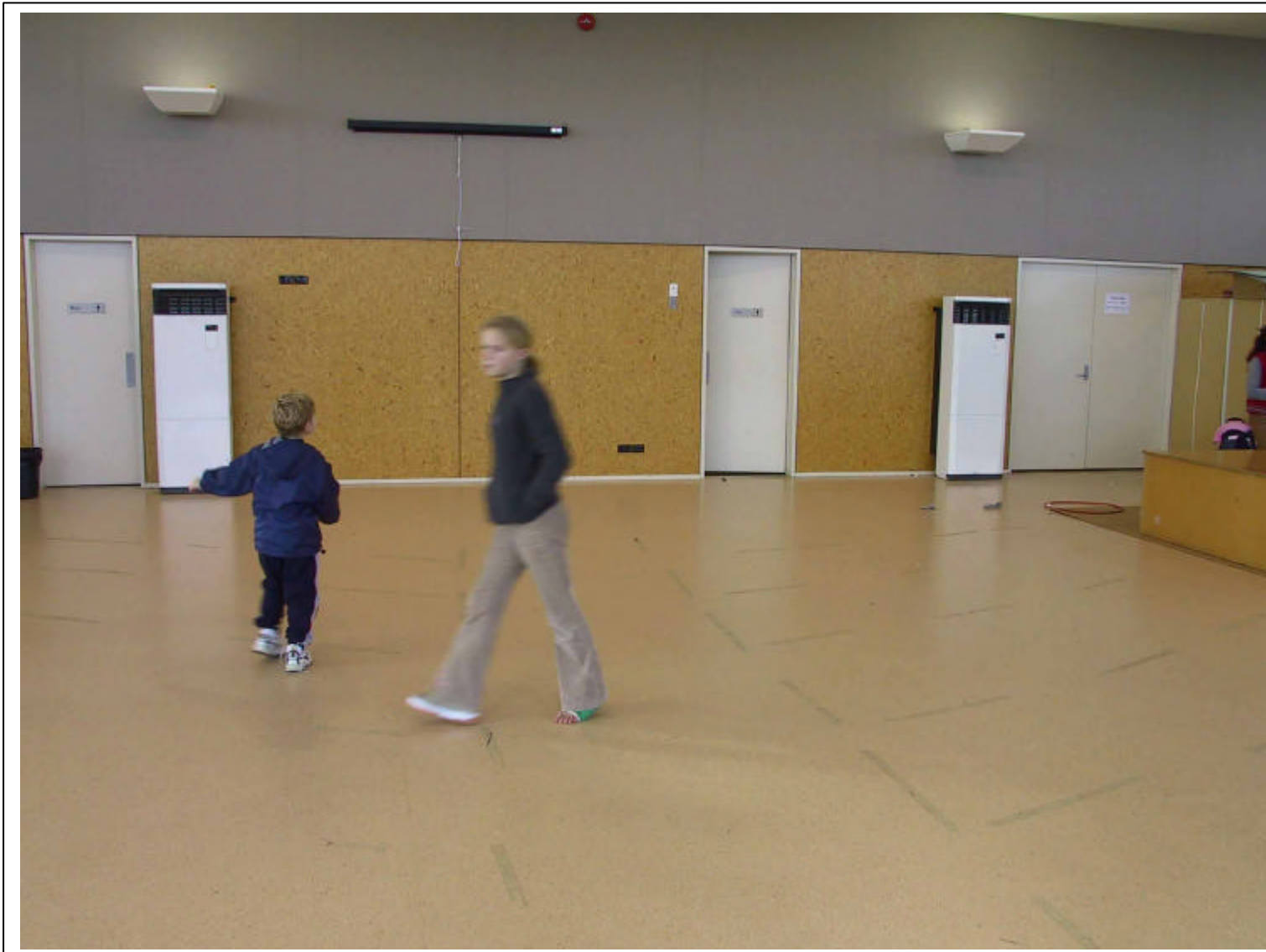
Two Rinnai RHFE Energysavers fitted into a School Hall. These are fitted with the external timer system