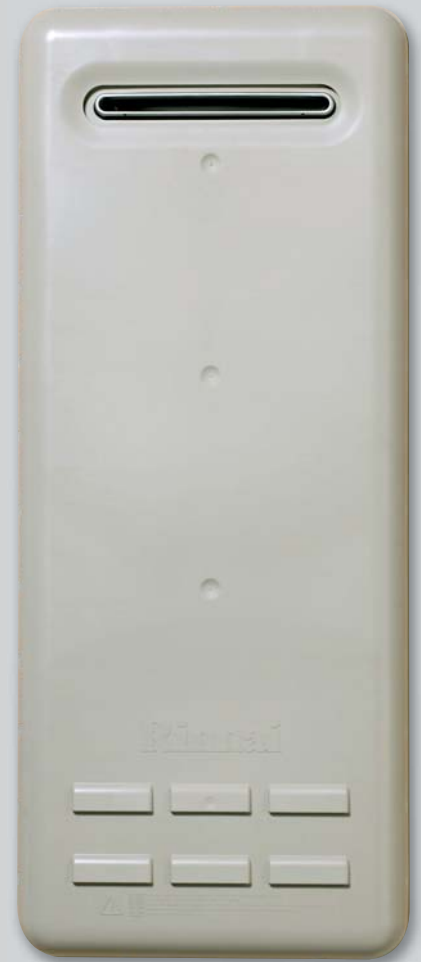
Composite Recess Box

The composite recess box enables an external continuous flow gas water heater to be recessed into an external wall, covered and out of sight. It is designed for new build installations as installation needs to commence during the framing stage, before internal linings, claddings or building wrap is applied.