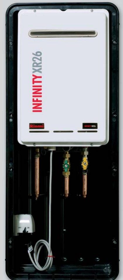
Composite Recess Box Open